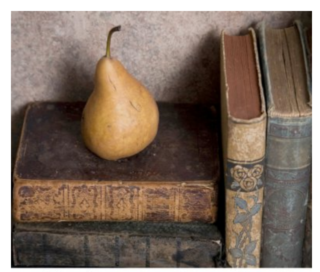
THE TRIMMED LAMP: AND OTHER STORIES OF THE FOUR MILLION